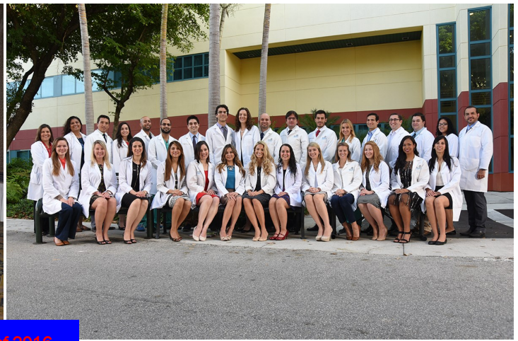
CLASS of 2016