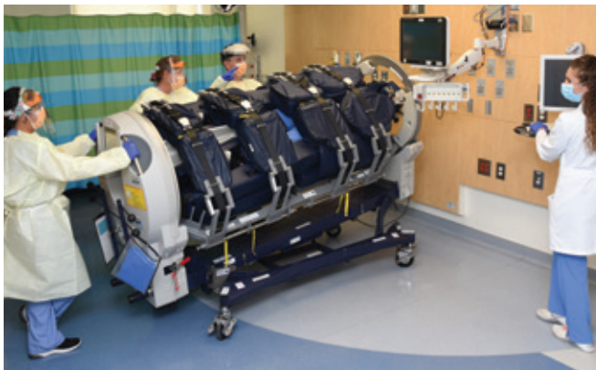
MIS-C Unit Roto-Prone Bed

Soon after the unit opened in May, the hospital received its first MIS-C patient.