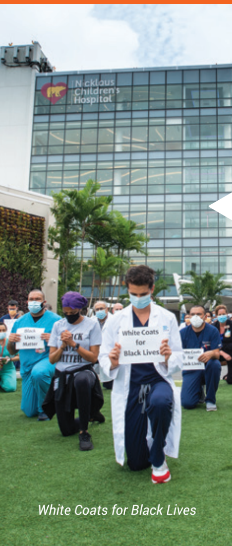
White Coats for Black Lives

The goal is to be the change we want to see in the world.